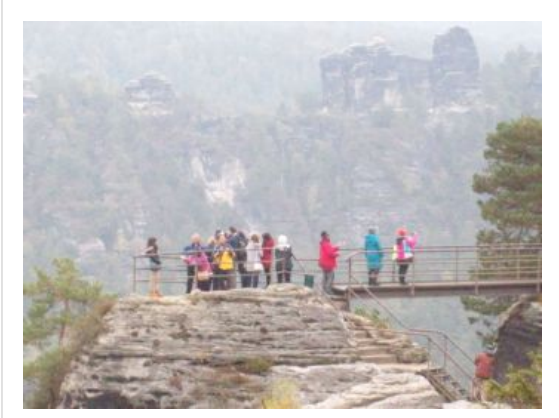
and looked down at the river