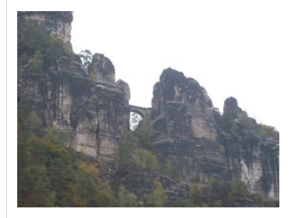
That's where we went next