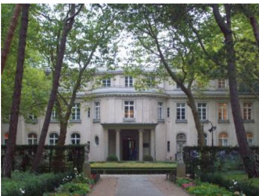
Here on Jan 20, 1942 representatives of the SS and other Nazi ministries developed the Wannsee Protocol documents which detailed and clarified the plan to murder all European Jews and well as coordinate the active participation of Germany's public administration in the genocide.