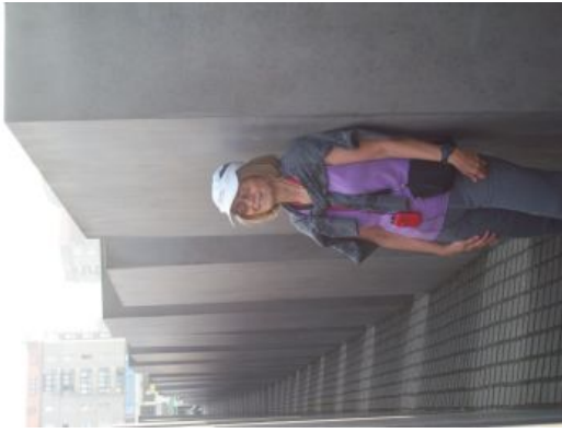
This sculpture in front of a Jewish cemetery remembers the deportations to the camps.