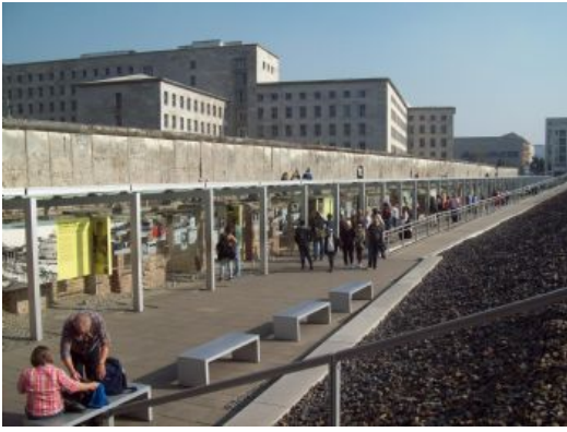
Memorials to those who died trying to flee to the west.