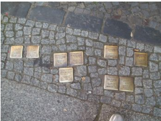
Outside of Berlin on our trip to Potsdam, we stopped at a lovely, peaceful location with a sinister history.