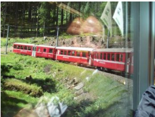
We stopped off to explore Poschiavo