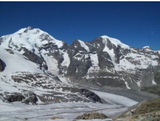
Back down the mountain