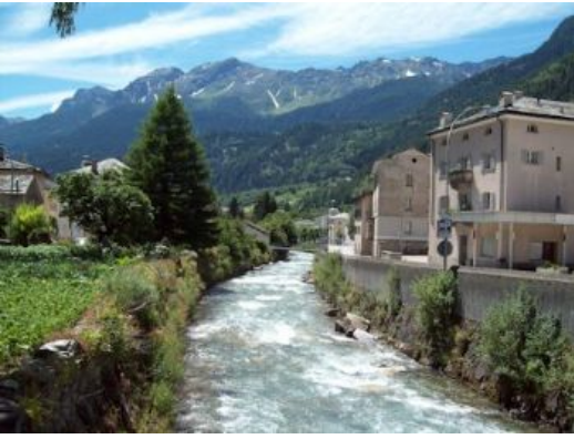
That peaceful river can flood the town as this poster showed us