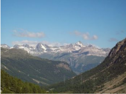
It felt like we were being taken to the top of the world