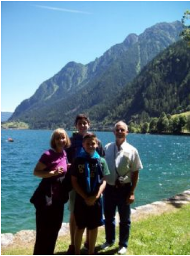
Le Prese was our turn around spot although the train continued to Tirano, Italy