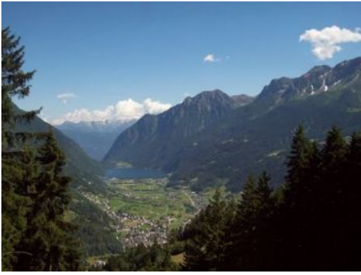
Alp Grum – our final stop