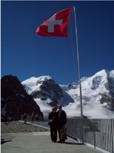
Some of us were more on top than others