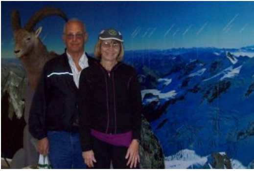
And onto the train again