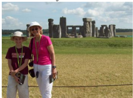
Can't just do CARDIO. How about some prehistoric STRENGTH TRAINING?

WALKING the land of Stonehenge, the stones may be the same but the new visitor's center provides much detailed archeological and historical information.