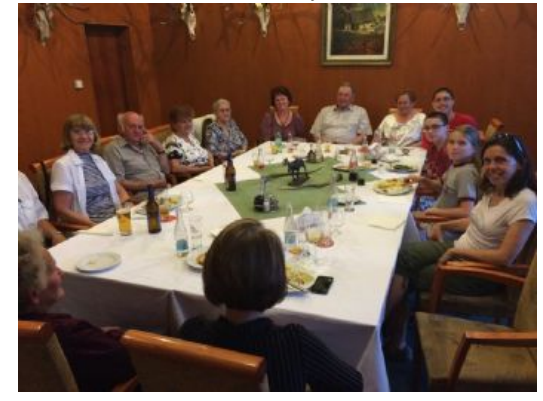
At the Eastern end of the country we visited with more relatives

Bratislava is a great city, only 45 miles from Vienna.