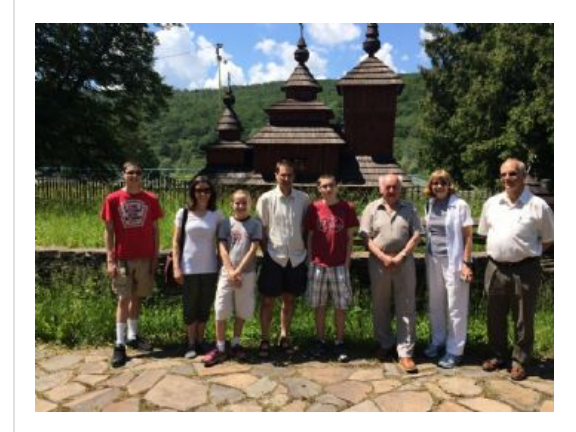
My grandfather died in 1935 during a visit to family in the "old country." My mother was 13. Now 3 generations that he never knew are visiting his grave.