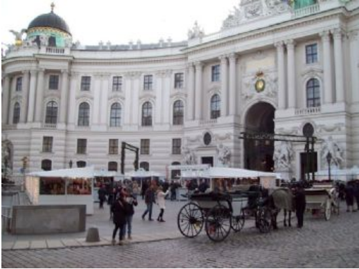
Another day, another country – our favorite city - Bratislava, the capital of Slovakia This castle was the capital of the Empire when Vienna was besieged and Budapest fell to the Turks.