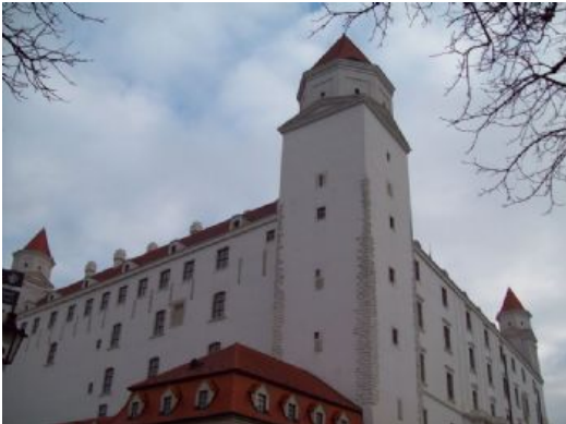
From the castle on a clear day you can see Hungary and Austria as well as Slovakia.