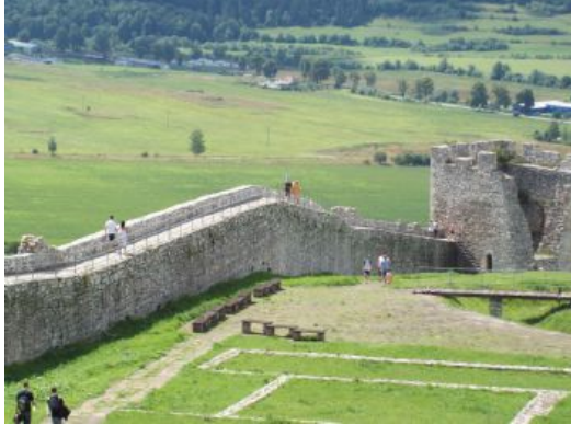
Stara Lubovna Castle is a few miles from my grandmother's village