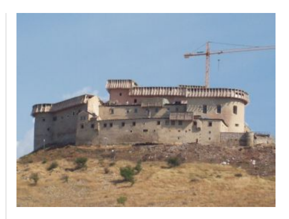
Spis Castle covers a huge area