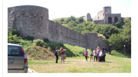
That's Austria across the river from Devin.