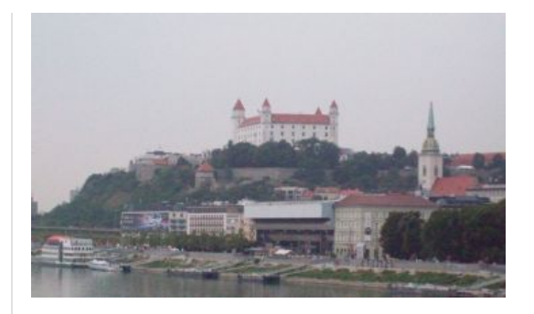
Devin Castle also overlooks the Danube and was originally a Roman outpost