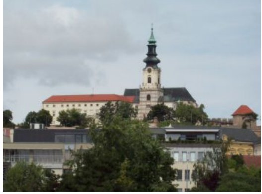
Bratislava Castle overlooks the Danube

Nitra Castle was designed as the location for the Archbishop of the region.