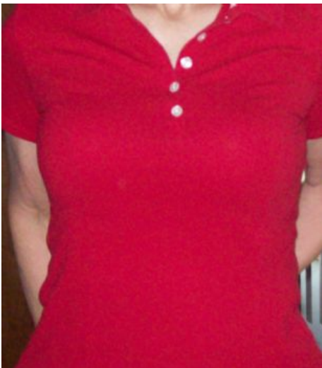
Me in the bombshell

Ooh, look how those buttons are straining.