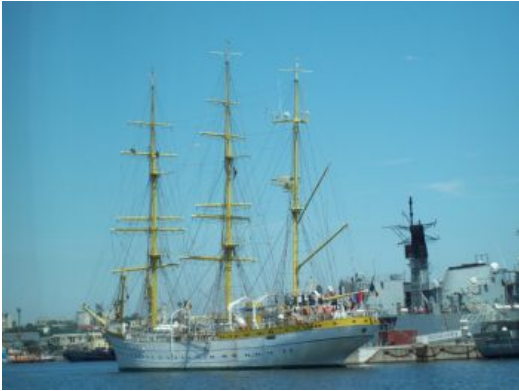
This beautiful sailing ship among all the modern vessels is used for training by the Navy.