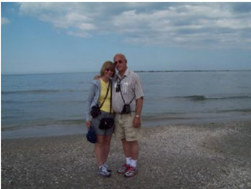
Museums are nice, but we all wanted the beach. Here we are at a local resort.