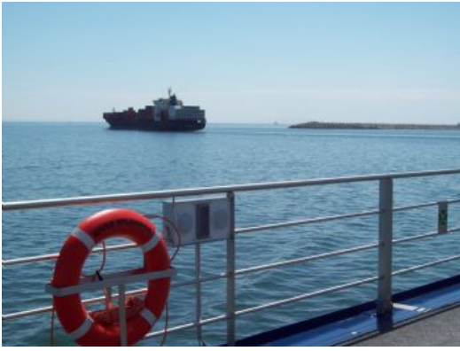
We docked at the Romanian port of Constanta