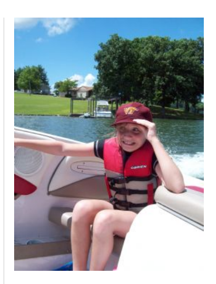
But he did just fine